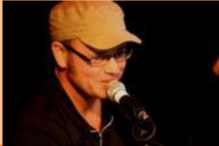
Bob's unforgettable melodies